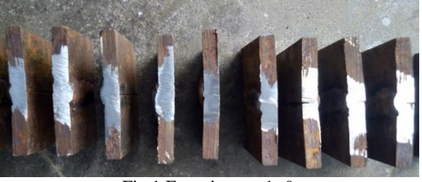
Fig 1 Experiments 1-9