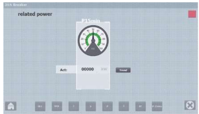
Figure 3: Active power drawn during the last period (15 min)