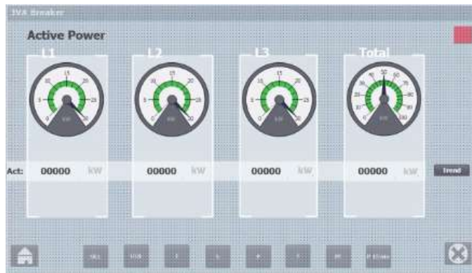
Fig. 1: Active power total and per phase