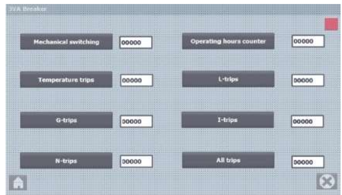
Fig. 4: Service and Maintenance information

The added value of a compact circuit-breaker with communication capability compared to a measuring device is the evaluation of service and maintenance information. For the application example, however, only a certain selection of the service and maintenance information (see above: Table 2 Energy and operation data) was shown.