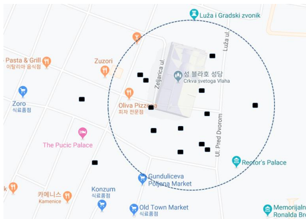
Fig. 2. Screen shot of map menu

Map function includes GPS navigating system which is a core function of this system. Once it is performed, the map is appeared based on the position information of the users. If the user is a group leader, the position information of group members is displayed as the Fig. 2. Also, leader can set the restricted territory as a circle in the map and alarming is alerted if the position of any members is out of the restricted territory.