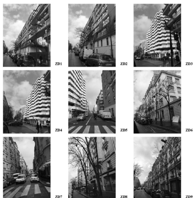
Figure 7. This collection of images illustrates the characteristics of the portion of Paris from an area not chosen by the respondents.

Figure 6. This image illustrates the sorting and grouping of pictures taken by the respondents.