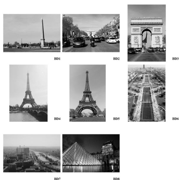
Figure 5. A collection of images supplied by a respondent.

4. The Eiffel Tower has the most photos compared to other places.