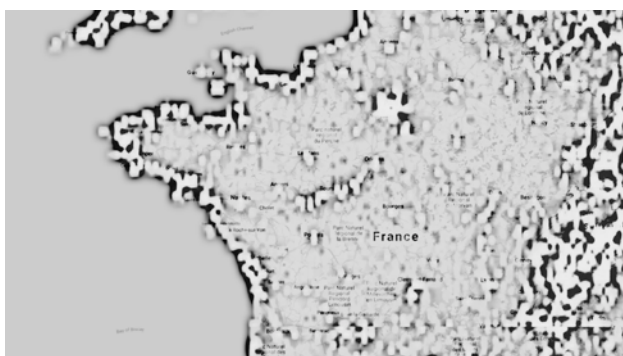
Figure 11. A map of photographic hot and cold spots for northern and central France recorded by the fall of 2017 (copyright © 2017 Zhi Yue, used by permission, all rights reserved).

The study team examined the fractal pattern on the hot and cold spots for Figures 7, 8, 9, 10. The fractal numbers for both black and white and grey scale derived values are somewhat similar across scales within their column (Table 1), slowly migrating to a smaller number as the area being studied enlarges. The actual number is not that important, but the relative consistency of the pattern in either black and white or in a greyscale suggests that the pattern is persistent across scales.