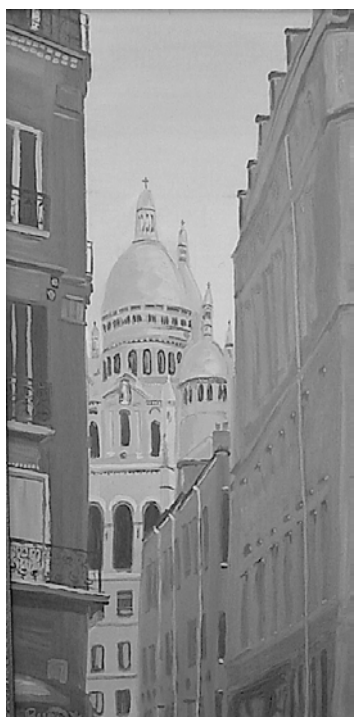
Figure 3. An artialised painting featuring Sacré Coeur, Paris, France (oil on canvas) (copyright © 2002 Jon Bryan Burley, all rights reserved, used by permission).