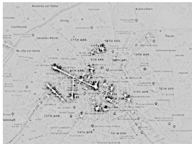
Figure 8. A map of photographic hot (very light grey) and cold spots (medium grey) in Paris, France observed in the fall of 2017. The map is similar in representation to the choices of the respondents in this study.

the border with Germany all appear to be 'hot spots.' The very light grey area are the 'hot spots.' The medium grey areas are the 'cold spots.' The near black areas are divisions between the light grey and dark grey. These areas can be assessed with the calculation of the fractal number for the pattern.