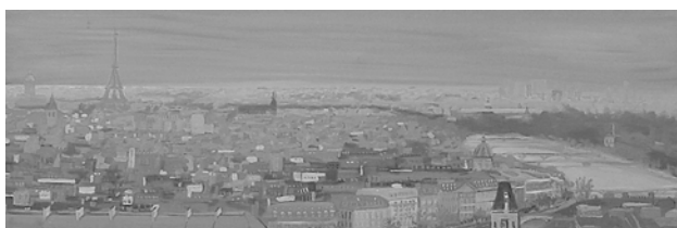
Figure 1. A painting of the historic Paris urban landscape from Notre Dame looking towards the Tour de Eiffel. The paintings is an example selecting an artialised image of Paris (Used by

Burley and Machemer describe how individuals often ignore or become desensitized to the many realities of a setting [12]. Instead, individuals record and capture composed images of their experiences that reflect an artialised environment (Figures 1, 2, 3). Painting and photography have much in common concerning what is depicted and what is often not chosen as a subject for study. In many respects, individuals are unconsciously reflecting the norms and expectations of culture/society concerning what is acceptable in the communication of the composition and contents of the environment.