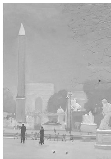
Figure 2. Another artialised painting from the Tulleries looking towards the Place de la Concorde and the Arc de Triomphe taken before a forthcoming walk of the Champs-Élysées (Used by permission of © 2004 Jon Bryan Burley, all rights reserved).

In contrast Claude Monet was an artist who at times selected subjects that challenged artialised notions [12]. For example, Monet decided to paint images of train stations, a topic that many considered not a subject suitable for study and painting [12]. Consistent with the ideas affiliated with Monet, Figure 4, presents a modern image of a power plant as observed from the rail line between Newcastle, United Kingdom and London. This subject would not be a typical choice as a topic for a painting. However, the image is a view that is typical of the type of scenes witnessed along the railway route. Figure 4 contains cultivated fields and a tree row with a rookery in the trees. The painting is an attempt to escape the cultural norms imposed by artialization.