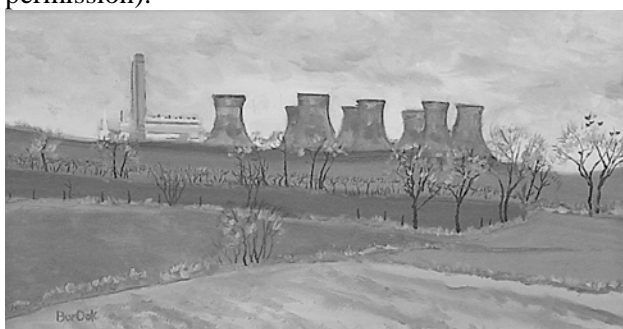
Figure 4. A painting of the landscape along the old Great North Eastern Rail (GNER) line in the United Kingdom (copyright © 2002 Jon Bryan Burley, used by permission, all rights reserved).