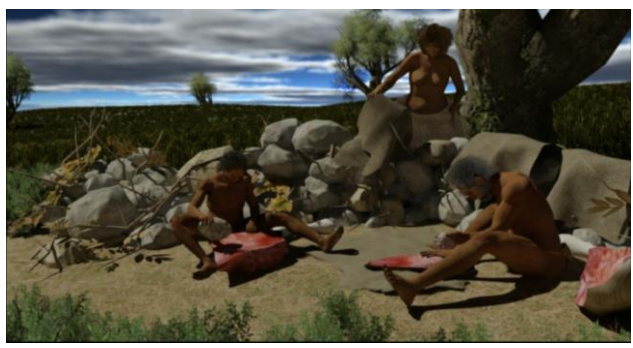
Fig. 13: The recreation of the Paleolithic camp "Casal do Azemel"