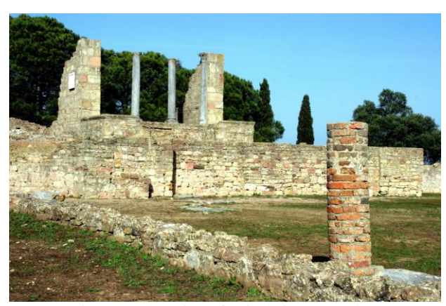
Fig. 19: The ruins of Miróbriga nowadays

At the moment, an early stage of a collaboration with an international team, in order to develop the first virtual recreations of some houses in the quite recent excavated Roman town of Miróbriga (figure 19), is in progress [26]. The interest in this Roman town is, according to the experts, the peculiar houses' architecture from this site.