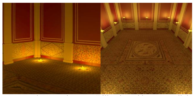
Fig. 10: The "Hunting room" illuminated by Roman light

After a process of digital conversion of the spectral properties of the light irradiated by this flame, figure 10 illustrates a scientific possible visual scenario of the "Hunting room" in the eyes of a 1<sup>st</sup> century local Roman inhabitant.