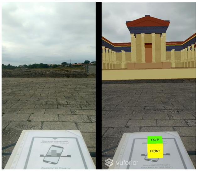
Fig. 15: Left: Facing the ruined temple of the Flavian Forum of Conimbriga. Right: The DinofelisAR application combine the virtual replica of the Forum with remaining (real) scenario

Gradually, the use of augmented reality (the combination of real with virtual content) strategies to present cultural heritage structures is emerging in museums or archaeological sites around the world. One such example is the DinofelisAR application [24], which positions the (virtual) Flavian Forum of Conimbriga accordingly with the real scenario of the ruined site (figure 15). This application has other interesting feature since it uses a handy mobile device, such as a smartphone, to conduct the experiment, becoming possible to be within the real ruins and explore 360-degree view of the virtual reconstruction. This makes it suitable for any visitor/tourist of this archaeologic site, since generally visitors have these equipment's. At this stage, this project is evolving to the use of other senses (audition and smell) to provide a more immersive and accurate sensation to its users.