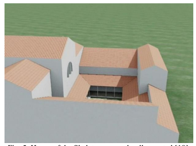
Fig. 5: House of the Skeletons procedurally created [10]

Another example of this working methodology can be found in figure 6. This figure, presents an essay of part of the Roman city of Conimbriga, where only three structures (identified by the arrows) where manually modeled (The Flavian Forum, the House of Cantaber and the House of the Apsidal Medianum), while the remaining were procedurally generated. Apart of minor architectural errors detected, this virtual model was validated by several experts in Roman architecture, which, in their opinion, evidence that this procedure is suitable for the recreation of other historical civilizations.