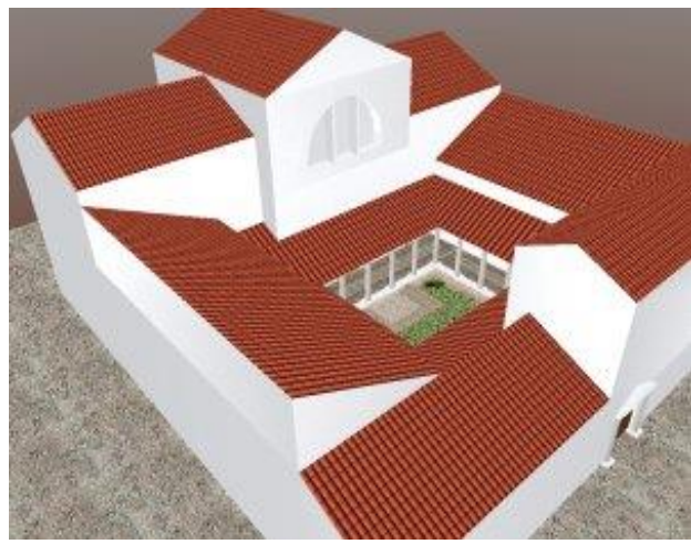
Fig. 4: House of the Skeletons manually developed [12]

Figure 4 depicts the House of the Skeletons of Conimbriga manually recreated for an online representation (bit.ly/houseoftheskeletons), whereas figure 5, presents a virtual reconstruction of the same historical house achieved through the means of a grammar. As we can perceive, they are almost identical, even though their different creation process — one was manually modeled while the other was procedurally constructed through means of a grammar.