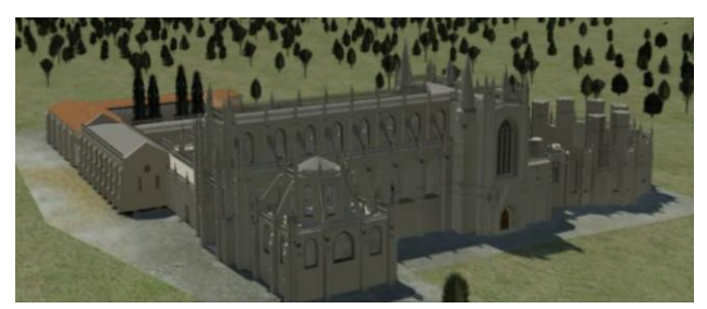
Fig. 12: The virtual reconstruction of the Monastery of Batalha

Some examples that can be stated are, for example: the video which reports the construction of the UNESCO World Heritage Site Monastery of Batalha (figure 12) [22], available on the Batalha Museum; the recreation of the life in a Lower Paleolithic pre-historic camp, "Casal do Azemel" in the aforementioned museum (figure 13); and the recreation of the world famous dinosaur footprints from 175 million years ago in the Pangea which is now the center of Portugal (figure 14), presented in one of the exhibits in "The Alviela Science Center – Carsoscópio" [23]. For a more immersive sense, the spectators of this video in Carsoscópio are settled in a 16-seat hydraulic moving platform.