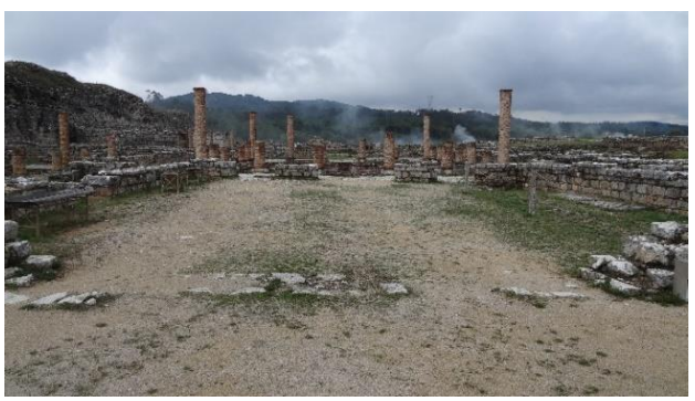
Fig. 1: House of Cantaber nowadays

This is the most common procedure, where the developer, uses authoring tools such as 3DS Max [4], Maya [5] or Blender [6], and generally with the supervision of heritage experts [7]. The main benefit of this working methodology is the production of highly detailed virtual models. In figures 1, 2 and 3 there are some examples of structures developed using this methodology: The House of Cantaber located in the ancient Roman city of Conimbriga [8] (figures 1 and 2) and the recreation of the Roman Villa of Collippo in Batalha (figure 3), available in the internationally awarded Museum of Batalha [9].