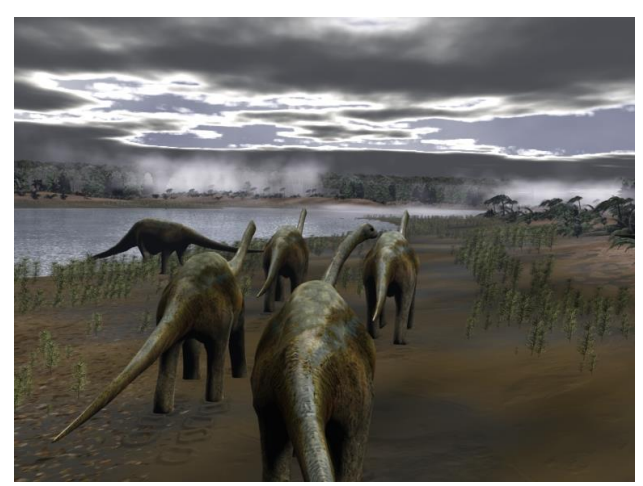
Fig. 14: The dinosaur footprints in Carsoscópio

Gradually, the use of augmented reality (the combination of real with virtual content) strategies to present cultural heritage structures is emerging in museums or archaeological sites around the world. One such example is the DinofelisAR application [24], which positions the (virtual) Flavian Forum of Conimbriga accordingly with the real scenario of the ruined site (figure 15). This application has other interesting feature since it uses a handy mobile device, such as a smartphone, to conduct the experiment, becoming possible to be within the real ruins and explore 360-degree view of the virtual reconstruction. This makes it suitable for any visitor/tourist of this archaeologic site, since generally visitors have these equipment's. At this stage, this project is evolving to the use of other senses (audition and smell) to provide a more immersive and accurate sensation to its users.