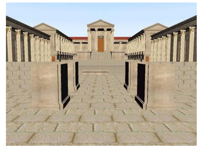
Fig. 16: The online available virtual reconstruction of the Flavian Forum of Conimbriga [10]

As an example of this methodology one could mention an older reconstruction of the Flavian Forum of Conimbriga (figure 16) [12], available at <a href="bit.ly/forumconimbriga">bit.ly/forumconimbriga</a>, or the reconstruction of the House of the Skeletons mentioned in section 3.2 (figure 4). One important aspect to mention is that, to visualize and interact with the virtual recreations, both require the installation of a specific plugin in the computer.