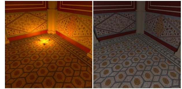
Fig. 11: A closeup to the mosaic and frescoes of the "Hunting room". Left: Illuminated by Roman light. Right: Illuminated by electric light

As stated earlier, relighting our ancient relics as close as possible to the period in question, can bring new and more accurate interpretations of that cultural heritage scenario. This can be observed in figure 11: notice that the circumferences viewed in the mosaic floor are perceived in light brown when one utilized electric light to illuminate the room, and the exact same circumferences are noticed as light red when the method to illuminate the room is the Roman lucerna [19, 20].