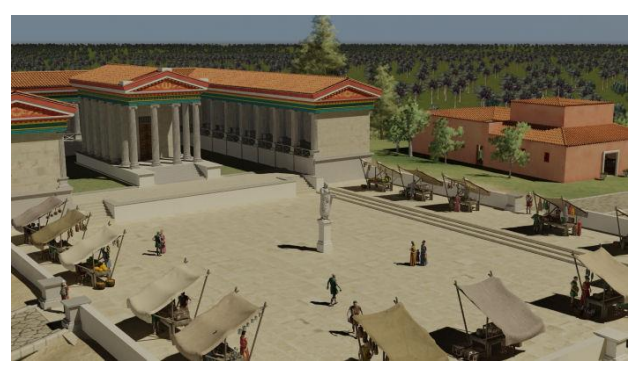
Fig. 3: A glimpse of the Collippo Roman forum

The manual modeling, albeit being time-consuming, allows total freedom in the creating process, facilitating the integration of any desirable feature to the virtual creations and is the best way to introduce features observed by archeologists and architects.