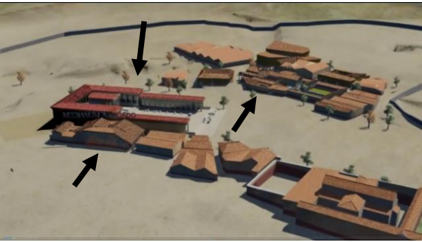
Fig. 6: An essay of Conimbriga using both manual and procedural modeling. The black arrows indicate the manual models. All the remaining structures were generated procedurally.