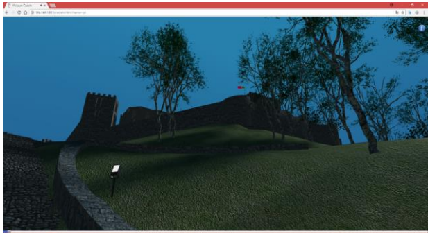
Fig. 18: An image of the WebGL guided tour to the Leiria Castle

All these features contribute to give the 3D model a dynamic feature to the virtual tour and making each experience unique.