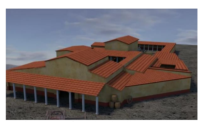
Fig. 2: House of Cantaber virtually recreated [10]