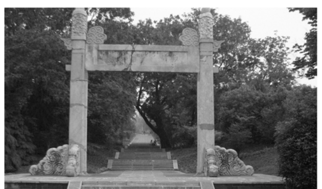
Figure 3. The Dismounting Archway with abstract cloud carving decorations and the uphill stone paved pathway with multiple groups of stairs in Ming Xiaoling Tomb, Nanjing, China.

finally the actual burial site [7]. All these elements are located along the continuous long pathway with symmetrical design landscape plant formal materials on the side. On the top of the "Dismounting Archway", there are carved ancient Chinese character informing all officials and visitors must dismount at this point to show great respect to the Emperor and the Empress [7]. The "Square City" is an a few stairs raised courtyard area with a tablet listing the achievements and the "virtues" of the Emperor [7]. The "Sacred Way" is a pathway continues about one mile with stone mythical creature statues that can represent the Emperor [7]. During the Ming dynasty, the tomb was guarded by 5,600 soldiers all the time [7].