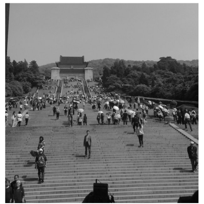
Figure 4. Dr. Sun Yat-sen's Tomb in rectilinear design with massive stair cases and naturalized landscape.

Fengshui, therefore the Mausoleum is built facing south on a hillside [6]. Sun's Mausoleum also partially adopts the form of Ming Xiaoling Tomb, which is the sequence of "the archway, the tripartite gate, the pillars, the hall, and even the long stairway that is analogous to the spirit road of an tomb" However, imperial [6]. for Sun's Mausoleum, the architect Lu Yanzhi did not use the mythical animal statues and traditional Chinese dragon ornaments because it was considered to be the old Chinese superstition tradition, which does meet with Sun's modern China wish [6].