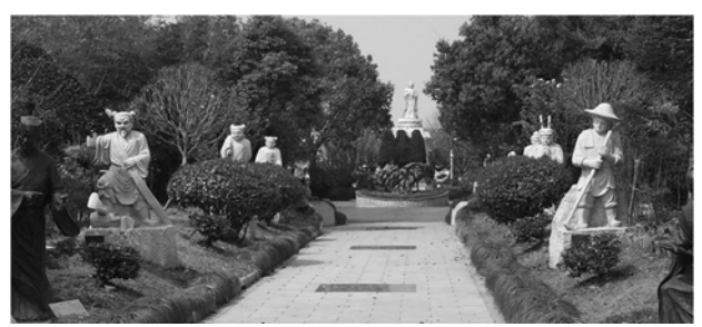
Figure 7. Stone statues of famous ancient scholars along stone paved straight pathway with golden statue of Guanyin in distance in Yongfu Yuanling Cemetery, Shanghai, China.