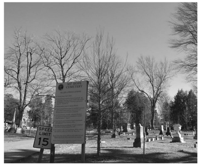
Figure 5. Lawn graveyard in Mt. Hope Cemetery with information signage and private vehicle accessible driveway, Lansing, MI, USA. (Copyright ©2017 Haoxuan Xu all right reserved used by permission).

information for Pere Lachaise and the two Chinese Imperial burial sites is secondary information learned from published documents. The information of these three sites have been presented in the literature review section. The information of three cemeteries in Michigan, three cemeteries in Shanghai, and the two rural ancestral burial grounds in Jiangsu is primary information collected from field study. In the methodology section below presents the primary information of the eight sites collected from field study.