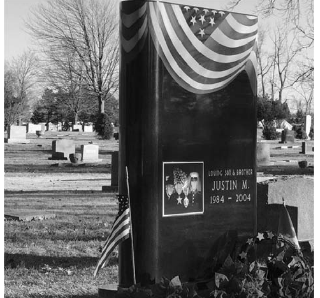
Figure 6. Gravestone with portrait, USA flag carving, and memorable in the Little Arlington Veteran Section in Evergreen Cemetery, Lansing, MI, USA.