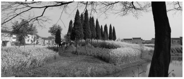
Figure 8. Xu's rural ancestral burial ground consisting group of bare dirt mound graves with arborvitae trees in agricultural field facing river. (Copyright ©2017 Aijing Shi all right reserved used by permission).