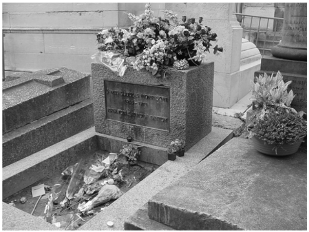
Figure 2. Gravesite of James Douglas Morrison with fresh cut flowers from the visitors in Pere Lachaise Cemetery, Paris, France.

Pere La Chaise is the "predecessor" of Parisian style American cemeteries such as Mount Auburn in Boston established in 1831 and Greenwood Cemetery in Philadelphia established in 1838 [1]. Even though the number of monuments have increased dramatically in Pere Lachaise, making the cemetery over crowded with monuments, and not much effort has been put on maintaining the picturesque quality of the cemetery [1]. Pere Lachaise is in fact always the start of modern rural cemeteries that gives many other English and American cemeteries inspirations on how to design develop picturesque, nature-oriented and environments [1].