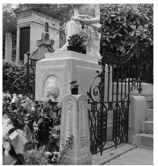
Figure 1. The gravesite of Chopin with sculptures, carving portrait of Chopin, fences, and fresh cut flowers from visitors in Pere Lachaise Cemetery, Paris, France.

According to Thomas Laqueur, Père-Lachaise "very quickly became the symbol of - almost a name for – a kind of burial place that triumphed whatever the new bourgeois civilization of the nineteenth century triumphed or hoped to triumph" [2]. Pere Lachaise became a popular place for visitors, because it was fascinating to see the huge contrast between Pere Lachaise and old-style western burial custom that existed prior to Pere Lachaise in Paris and other European Countries [1]. Every other place wants a burial space like Pere-Lachaise, but the cemeteries are not meant to be the exact copy of Pere-Lachaise instead they are all supposed to have their own unique identities based on the different local context of each place [2] (Figures 1 and 2).