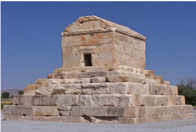
Figure 2: The tomb of Cyrus II dates to 559-29 B.C.E at Pasargad

Establishment of a united kingdom by Cyrus in his time put an end to quarrels among different groups who were rivals in Persia like Persians and Medes. In order to create integrity among different ethnicities living in Persia, he unified all diversified groups and tribes under a unique formal system under name of Persian Empire.