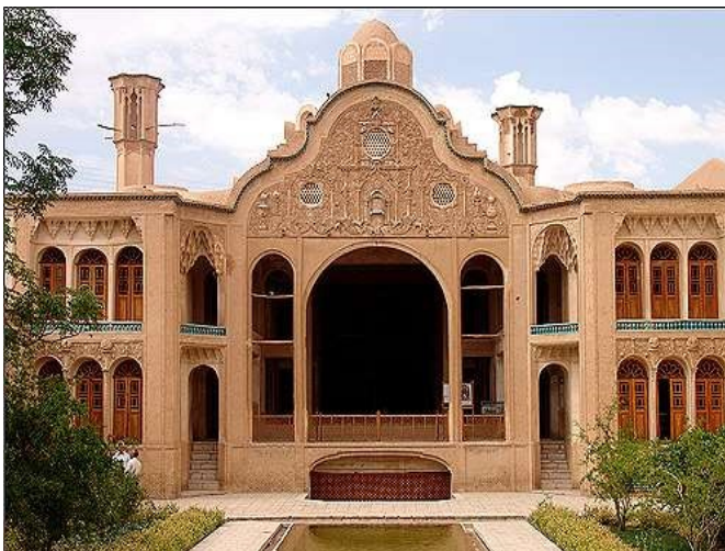
Figure 5: Borujerdi House

It consists of a rectangular beautiful courtyard, delightful wall paintings by the royal painter Kamal-ol-molk, and three 40 meter tall wind towers which help cool the house to unusually cool temperatures. It has 3 entrances, and all the classic signatures of traditional Persian residential architecture, such as biruni and daruni (andarun). The house took eighteen years to build using 150 craftsmen.