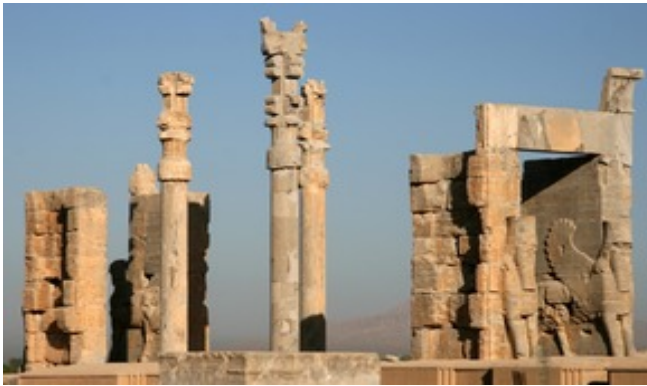
Figure 1: Royal palace Of the Achaemenid Empire Kings

today's Fars Province. UNESCO declared the ruins of Persepolis a World Heritage Site in 1979 [9]. Its ruins are still evidence of a splendid empire and a great civilization. During their era agriculture made enormous progress. Also, ironworks, stone carving, use of stone in building, architecture, construction, use of gold and copper developed remarkably. The Achaemenids had a very effective and intricate fiscal and accounting system and usually used coins in their transactions [10].