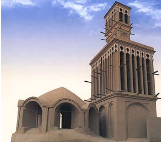
Figure 7: Air traps

Function of the cistern found below most wind towers in warm dry regions was to help balance humidity inside the structure. In many desert buildings, wind towers were built on top of a lavabo (howzkhaneh, which functioned as a summer courtyard). The wind was directed over the pool where it evaporated the water and took the cool air into other rooms. The first historical evidence of wind towers in Iran dates back to the fourth millennium BC. To counter the harshly variable climates of the country, Iranians invented wind towers which still stand in various desert towns except in areas where the city was located in a valley or in places experiencing frequent violent storms. Wind towers are an inseparable part of the architecture of central and southern Iran, namely Yazd, Kashan, Bam and villages on the Persian Gulf coast. In desert areas houses are closely set together, high-walled and made of baked brick with small windows facing away from the sun to minimize heat and maximize shade. In order to provide occupants with constant comfort, wind towers were built with a four-directional orientation to catch wind from all directions and guide it into the house. Mr. Gholam Hossein Memarian divided air traps into two categories: