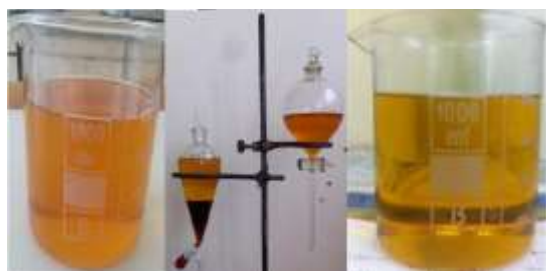
Fig. 3: Visual presentation of the process from cooking oil waste and separation process to the desired Biodiesel product.

Another task after the separation of the phases which is shown in the Figure 3, is the process of removing the soap.