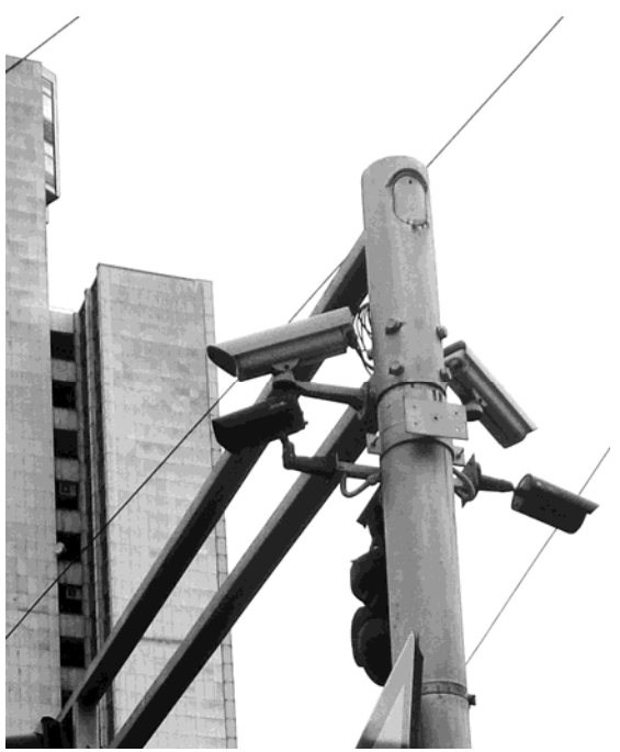
Figure 1. NIR camera on busy intersections.

paper the coverage of carbon black dye has been reduced to 40% of coverage considering that the green canvas has a property of strong ink absorption in jet digital print. A general printing theory with dye twins has been given in the paper [3] with application on documents performed with safety papers. In this paper the procedure of connecting two independent images V (visual) and Z infrared gray image is being expanded to dyed surfaces all the way until black. When printing to a black canvas that does not have a visually dyed image, a hidden image is being performed that is being detected with a ZRGB camera. The research includes the application of IRD in the field of camouflage design in nature. IRD procedure of VZ separation of printing dyes is being evaluated by a spectral analysis with a forensic instrument [4].