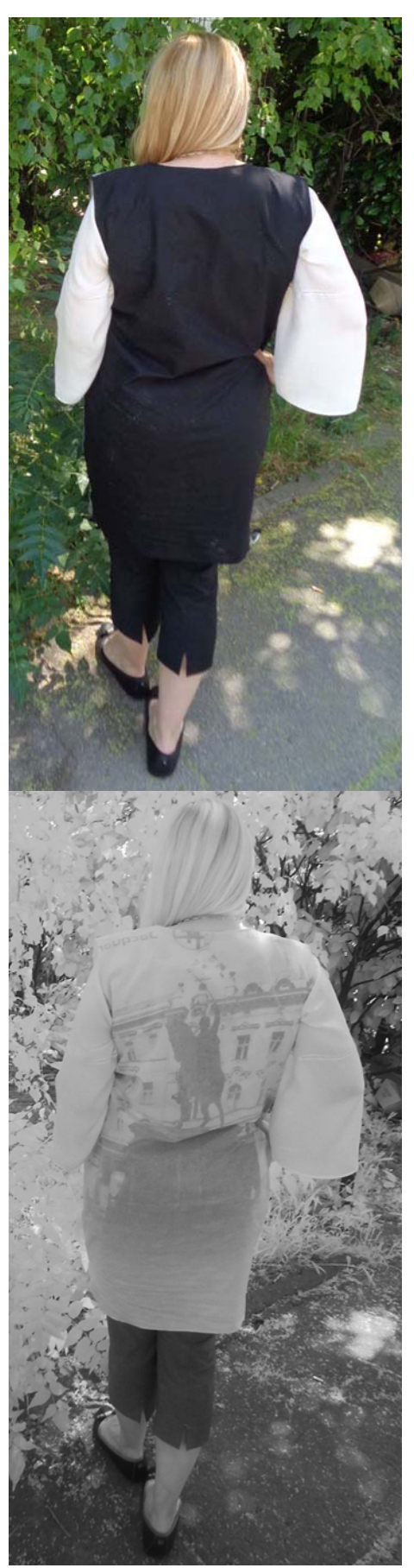
Figure 6. the back side of the black dress

A blockade of the color yellow and the beginning of magenta has been performed at the position of 580 nm. The innovative presentation with light blockades provides a study of the proportion of certain process components found in the digital plotter. Above 620 nm not even a red tone can be found. The only remaining color is cyan. Light absorption in NIR - Z2 spectrum is being observed only above 800 nm.