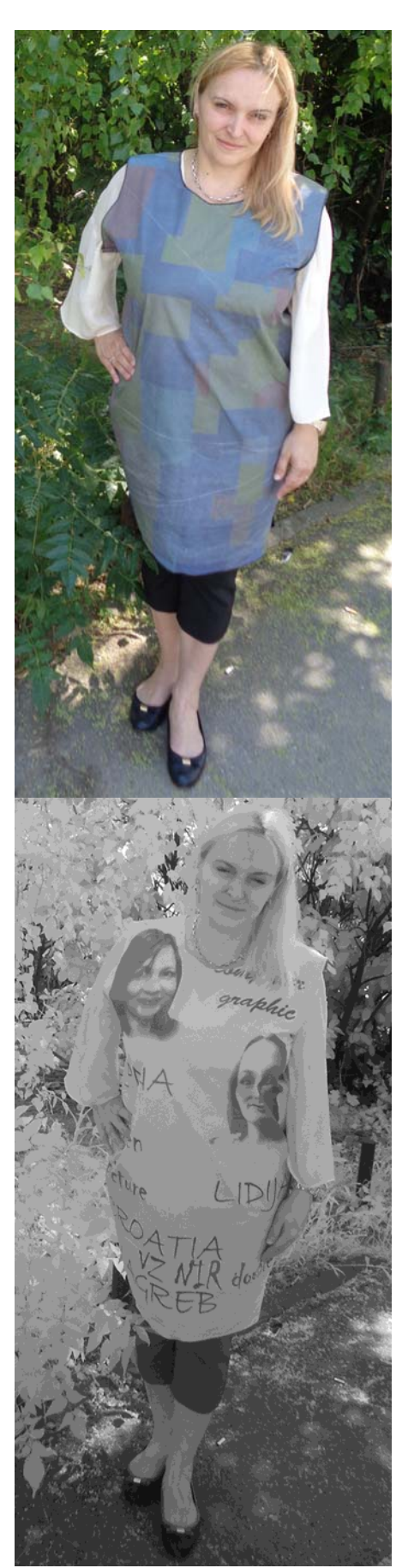
Figure 4 computer graphics on the dress

A hidden image on canvas is being demonstrated in this paper. The double image is being demonstrated with a ZRGB camera as a video recording set to a web space, and as a reproduction print in this printed article. There is an image of a computer graphics of this article's author from the period of "New tendency" [7] on the front side of the dress. The author has today expanded this same visual art work to the area of infrared graphics. They have built into the visual graphics the portraits of this article's authors as a graphics invisible to the naked eye.