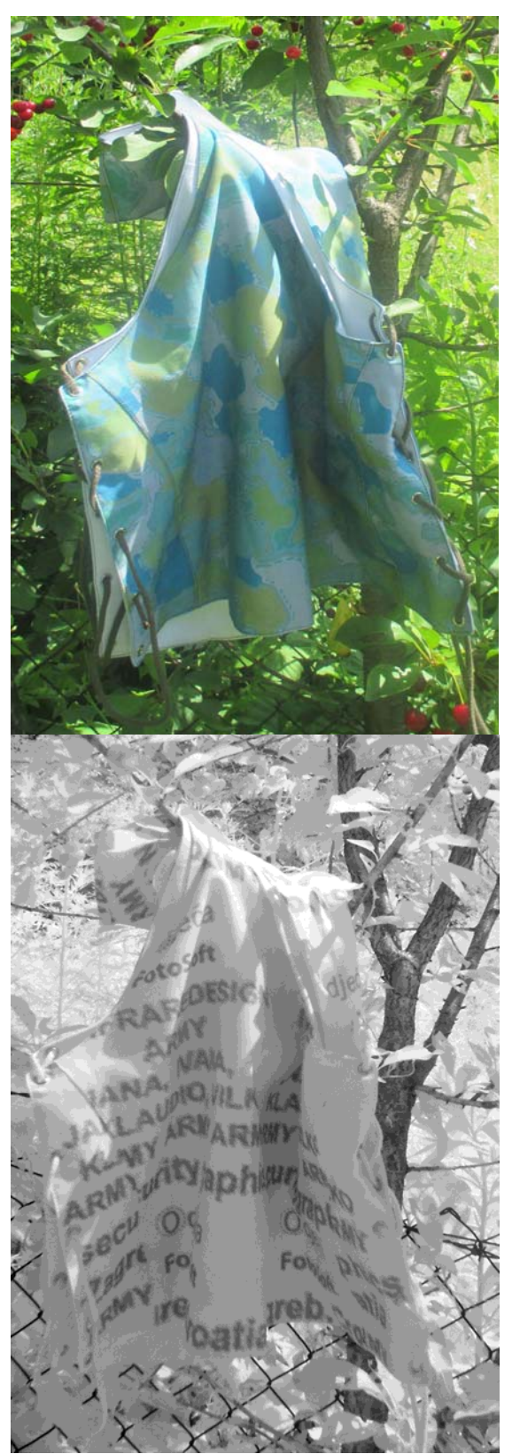
Figure 2. Jacket in NIR an orchard

The cause for this paper is an IRD idea based on creating double images on clothes. A precondition to that are cameras that are part of our daily life. Security in the city and private area is based on infrared cameras