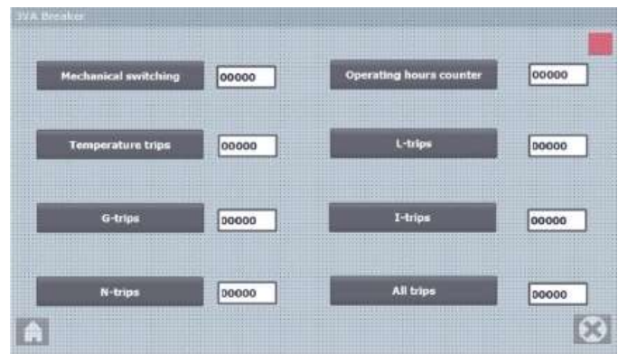
Fig. 4: Service and Maintenance information

The added value of a compact circuit-breaker with communication capability compared to a measuring device is the evaluation of service and maintenance information. For the application example, however, only a certain selection of the service and maintenance information (see above: Table 2 Energy and operation data) was shown.