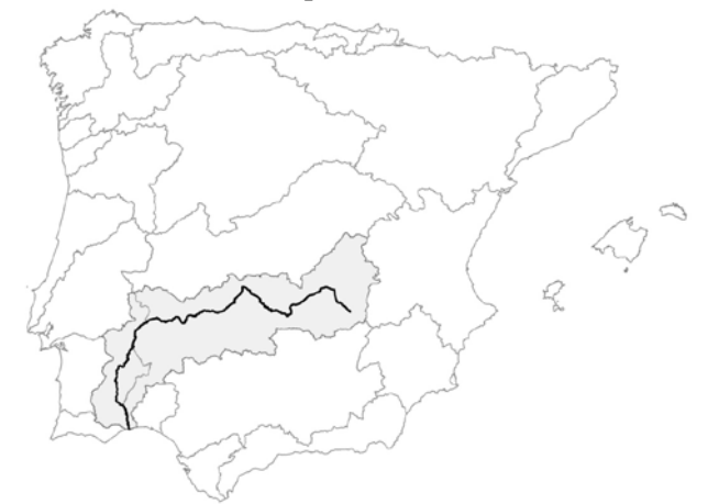
Fig. 1: The international basin of the River Guadiana location map.