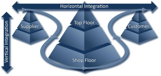
Fig.1 Integration of processes across company boundaries

Two integration scenarios can be discussed, as shown in figure 1: While vertical integration means the connection of information systems from the top floor to the shop floor inside one and the same company, horizontal integration means the integration of business processes along the supply chain.