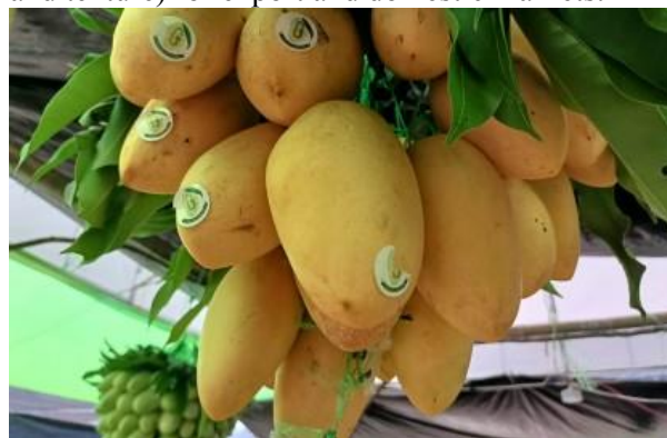
Figure 1. Guimaras Mangoes

This research aims to determine the optimal harvest time by analyzing the chemical compositions such as reducing sugars, titratable acidity, and pH—at different developmental stages. Understanding the kinetics of these parameters is vital for identifying the precise, optimal maturity stage that guarantees the best organoleptic characteristics (sweetness, aroma, and texture) for export and domestic markets.