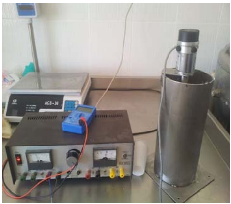
Fig. 4 small churn for samples

impeller. Another 4-liter churn is designed as in Fig.4 to perform quick experiments to save milk.