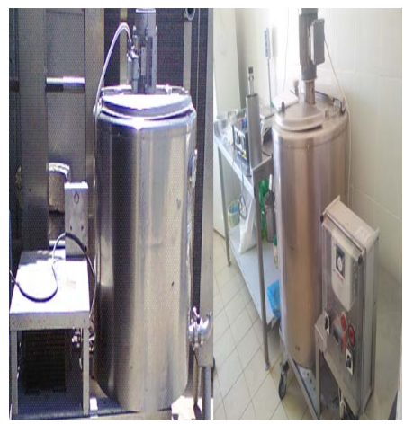
Fig. 3 a 200-Liter Butter churn

A churn is designed and built as in Fig. 3 to perform many experiments measuring conductivity, density, and viscosity before and after the churning process while controlling the temperature and speed of rotation.