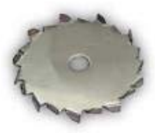
Fig. 2 Shear impeller

The tank is made from a grade food stainless steel and have no interaction with the products. It has two jacketed layer and have the ability to heat and cool the product electrically. It also contains a special agitator which can move in different speeds. A low speed for agitating the milk and the product during heating and cooling. A High speed for churning the yogurt. The agitator has round shape impeller with a diameter of 15 cm with a very sharp teeth as shown in Fig. 2.