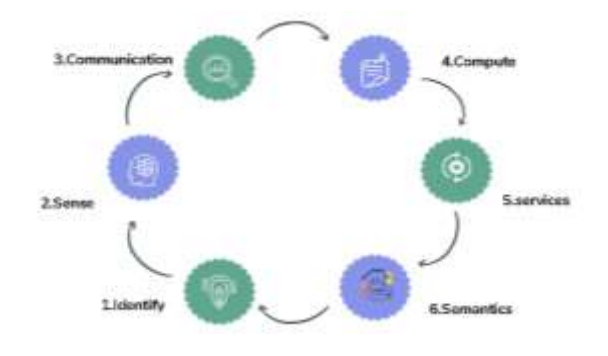
Fig-1 The IoT elements

certain components in order to be used effectively. IoT elements are covered in this section. Figure 1 illustrates the components required to offer IoT capabilities. These elements' names are as follows.