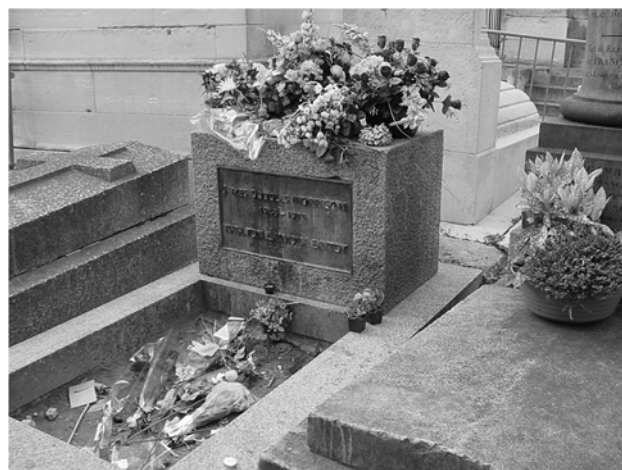
Figure 2. Gravesite of James Douglas Morrison with fresh cut flowers from the visitors in Pere Lachaise Cemetery, Paris, France. (Copyright ©2005 Jon Bryan Burley all right reserved used by permission).

Pere La Chaise is the “predecessor” of Parisian style American cemeteries such as Mount Auburn in Boston established in 1831 and Greenwood Cemetery in Philadelphia established in 1838 [1]. Even though the number of monuments have increased dramatically in Pere Lachaise, making the cemetery over crowded with monuments, and not much effort has been put on maintaining the picturesque quality of the cemetery [1]. Pere Lachaise is in fact always the start of modern rural cemeteries that gives many other English and American cemeteries inspirations on how to design and develop picturesque, nature-oriented environments [1].