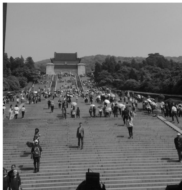
Figure 4. Dr. Sun Yat-sen’s Tomb in rectilinear design with massive stair cases and naturalized landscape..

Fengshui, therefore the Mausoleum is built facing south on a hillside [6]. Sun’s Mausoleum also partially adopts the form of Ming Xiaoling Tomb, which is the sequence of “the archway, the tripartite gate, the pillars, the hall, and even the long stairway that is analogous to the spirit road of an imperial tomb” [6]. However, for Sun’s Mausoleum, the architect Lu Yanzhi did not use the mythical animal statues and traditional Chinese dragon ornaments because it was considered to be the old Chinese superstition tradition, which does not meet with Sun’s modern China wish [6].