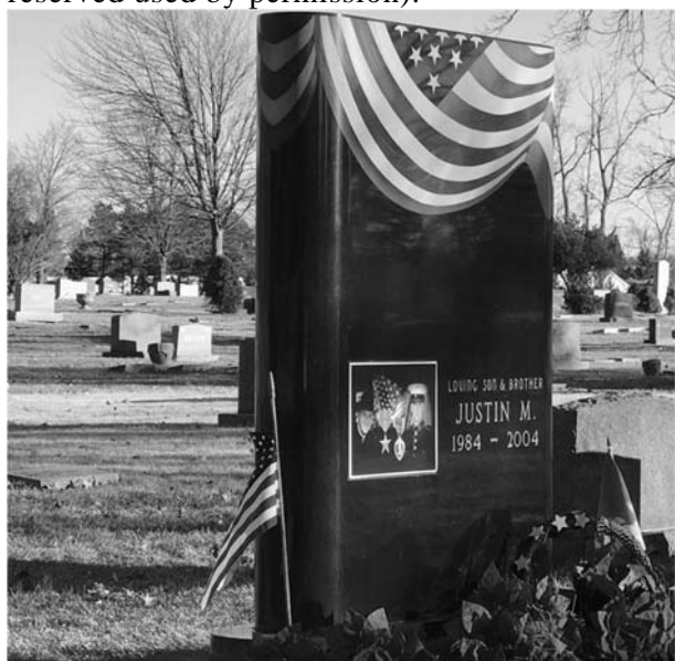
Figure 6. Gravestone with portrait, USA flag carving, and memorable in the Little Arlington Veteran Section in Evergreen Cemetery, Lansing, MI, USA. (Copyright ©2017 Haoxuan Xu all right reserved used by permission).