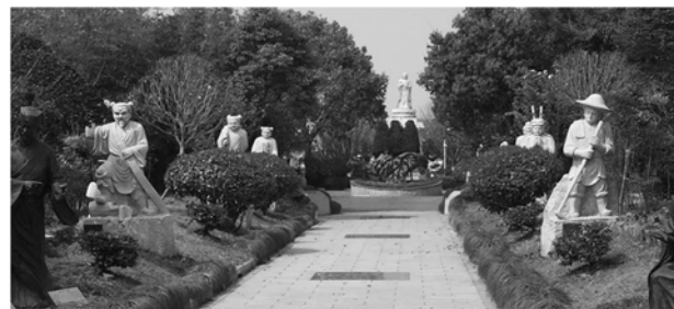
Figure 7. Stone statues of famous ancient scholars along stone paved straight pathway with golden statue of Guanyin in distance in Yongfu Yuanling Cemetery, Shanghai, China.