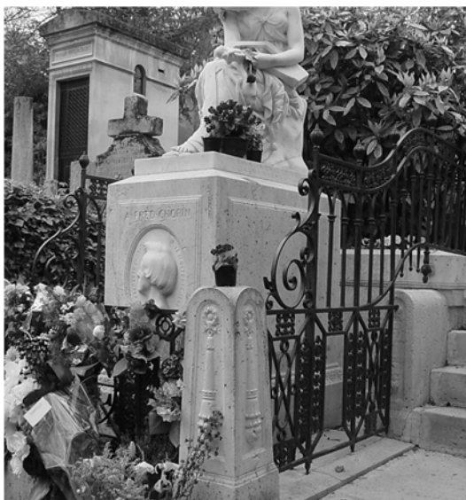
Figure 1. The gravesite of Chopin with sculptures, carving portrait of Chopin, fences, and fresh cut flowers from visitors in Pere Lachaise Cemetery, Paris, France.

According to Thomas Laqueur, Père-Lachaise “very quickly became the symbol of – almost a name for – a kind of burial place that triumphed whatever the new bourgeois civilization of the nineteenth century triumphed or hoped to triumph” [2]. Pere Lachaise became a popular place for visitors, because it was fascinating to see the huge contrast between Pere Lachaise and old-style western burial custom that existed prior to Pere Lachaise in Paris and other European Countries [1]. Every other place wants a burial space like Pere-Lachaise, but the cemeteries are not meant to be the exact copy of Pere-Lachaise instead they are all supposed to have their own unique identities based on the different local context of each place [2] (Figures 1 and 2).