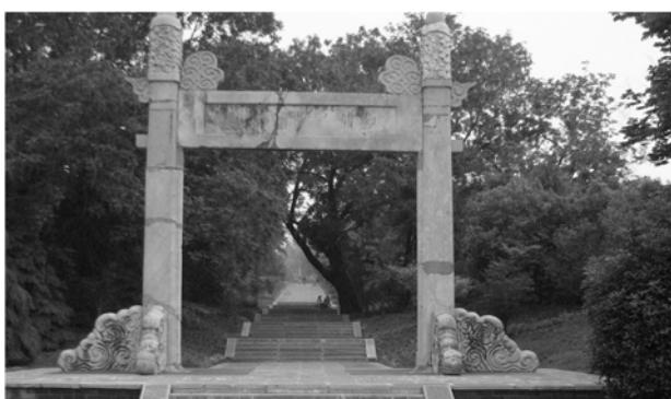
Figure 3. The Dismounting Archway with abstract cloud carving decorations and the uphill stone paved pathway with multiple groups of stairs in Ming Xiaoling Tomb, Nanjing, China.

finally the actual burial site [7]. All these elements are located along the continuous long pathway with formal symmetrical design landscape plant materials on the side. On the top of the “Dismounting Archway”, there are carved ancient Chinese character informing all officials and visitors must dismount at this point to show great respect to the Emperor and the Empress [7]. The “Square City” is an a few stairs raised courtyard area with a tablet listing the achievements and the “virtues” of the Emperor [7]. The “Sacred Way” is a pathway continues about one mile with stone mythical creature statues that can represent the Emperor [7]. During the Ming dynasty, the tomb was guarded by 5,600 soldiers all the time [7].