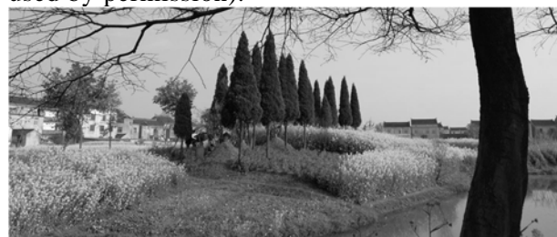
Figure 8. Xu's rural ancestral burial ground consisting group of bare dirt mound graves with arborvitae trees in agricultural field facing river.