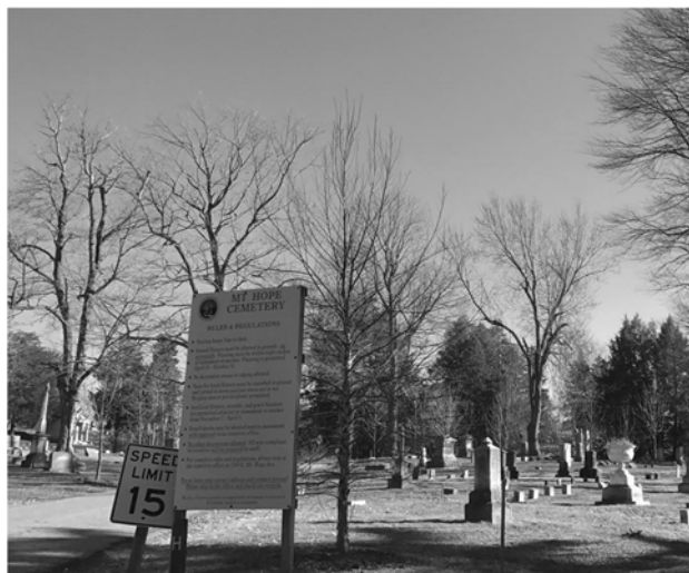
Figure 5. Lawn graveyard in Mt. Hope Cemetery with information signage and private vehicle accessible driveway, Lansing, MI, USA.

information for Pere Lachaise and the two Chinese Imperial burial sites is secondary information learned from published documents. The information of these three sites have been presented in the literature review section. The information of three cemeteries in Michigan, three cemeteries in Shanghai, and the two rural ancestral burial grounds in Jiangsu is primary information collected from field study. In the methodology section below presents the primary information of the eight sites collected from field study.